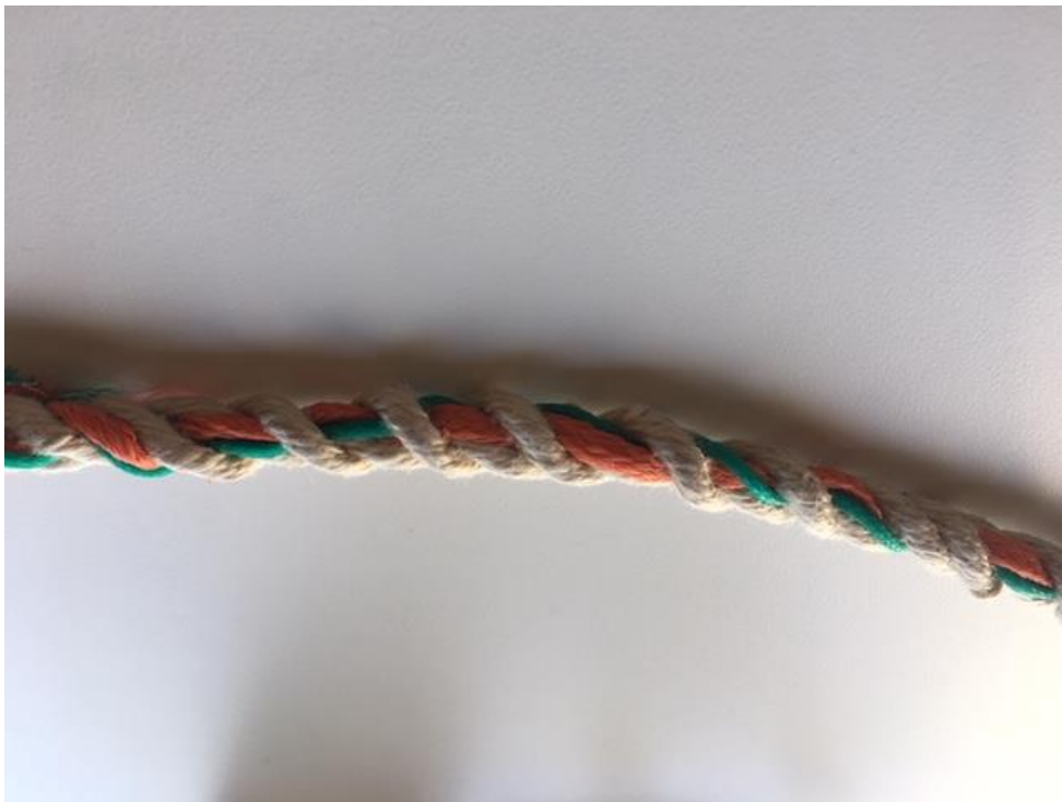
Figure B - Colour combo identifying Region, Species and Fishing Area

as per colour scheme this is Quebec (green), snow crab (orange) interlaced on same rope section